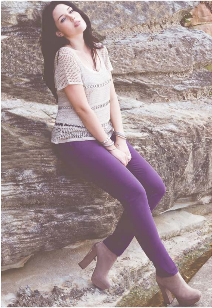
'Purple Haze' coloured skinny leg Jeans,'Round &Round' Crochet Tee.