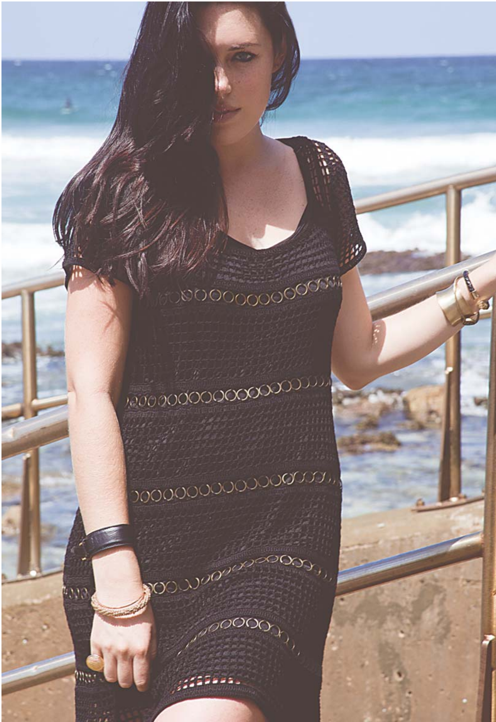
'For Keeps Hand Crocheted hoop Dress'.