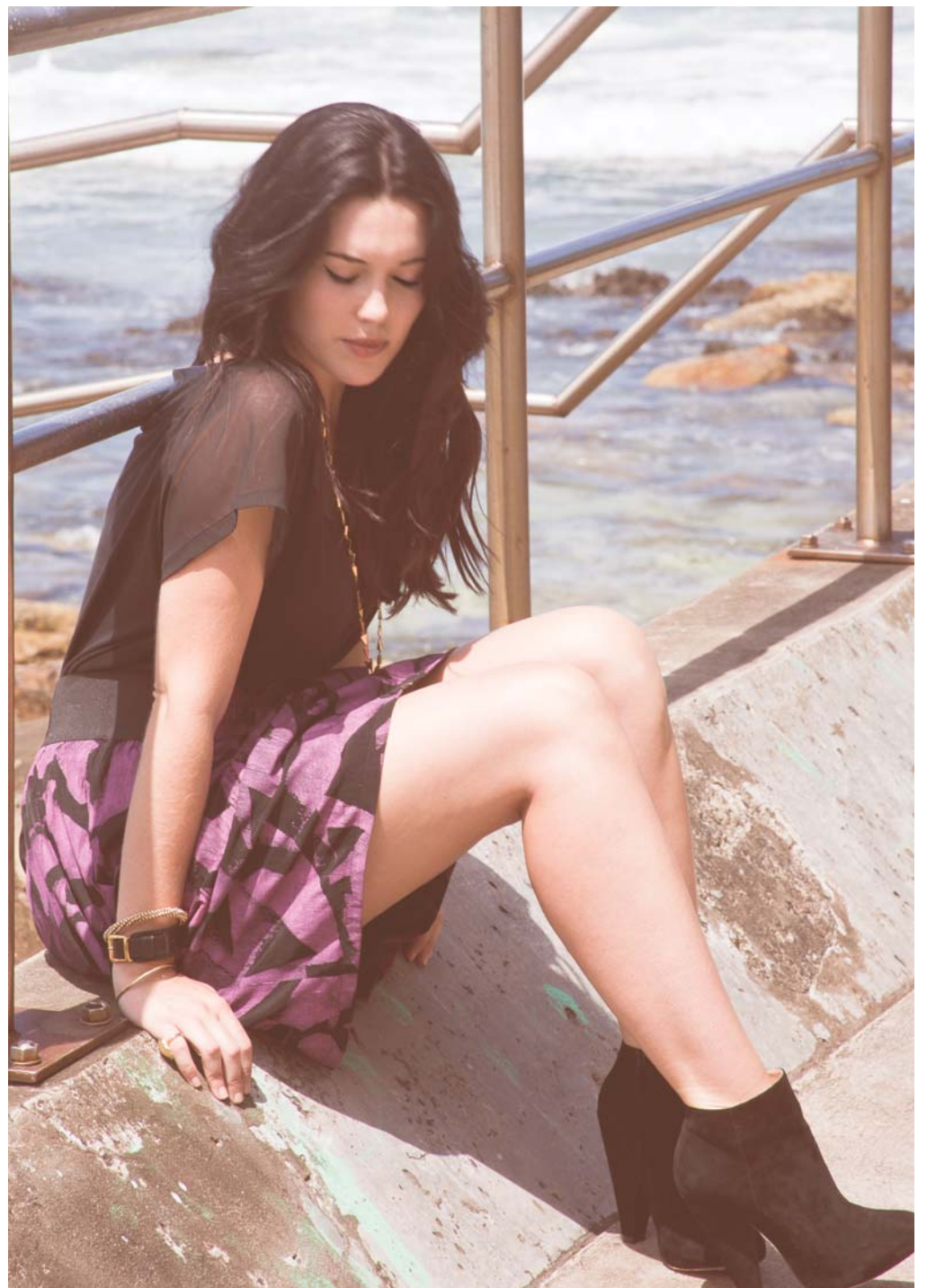
'Caught Out There' Skater Skirt, 'Bubblegum' Tee.