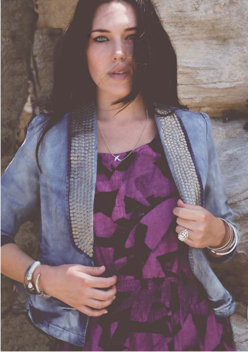
'Take Me Away' crop Jacket, 'Caught Out There' printed dress