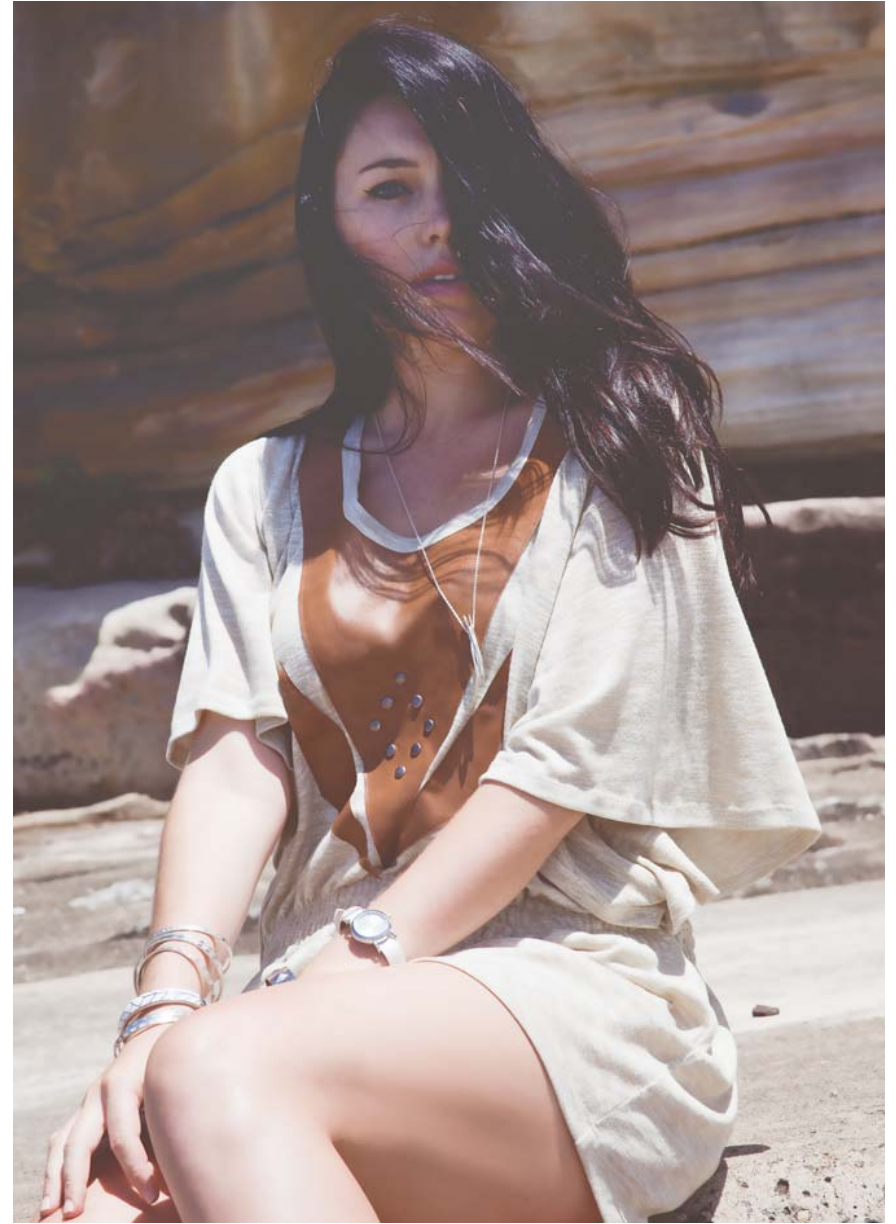
'Trojan' knit tunic with leather panel and stud detail.