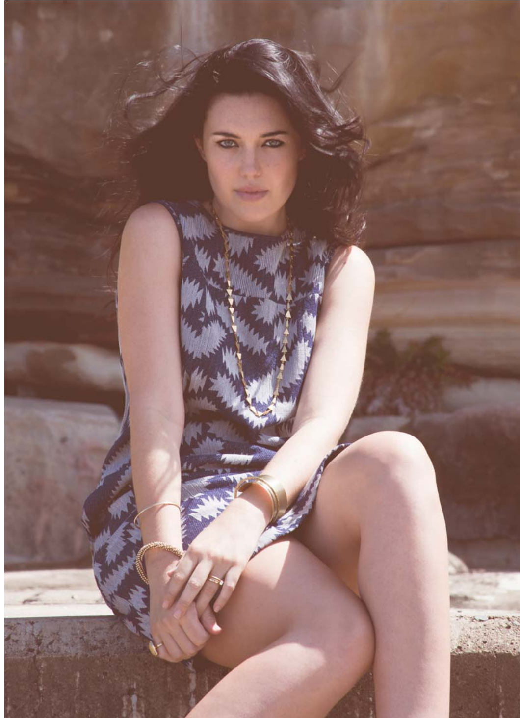
'Ill Make You Happy' Shift Dress.