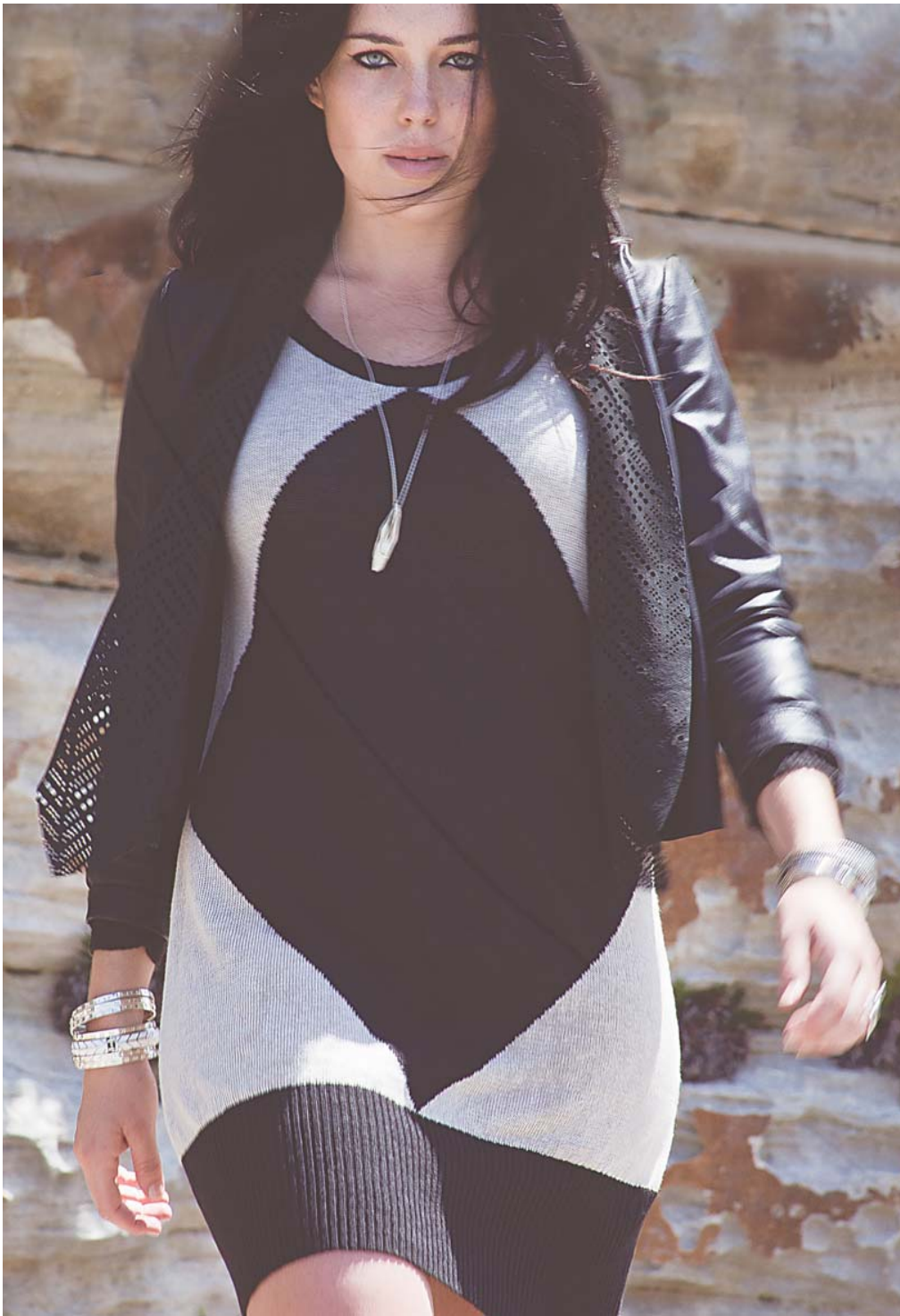
'Just For Now' intarsia knit dress, 'On Tour' laser cut leather jacket.