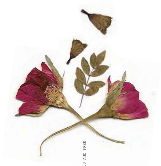
17 Sundays | wild flower | spring summer 2015 | EVERYTHING GOOD IS WILD AND FREE