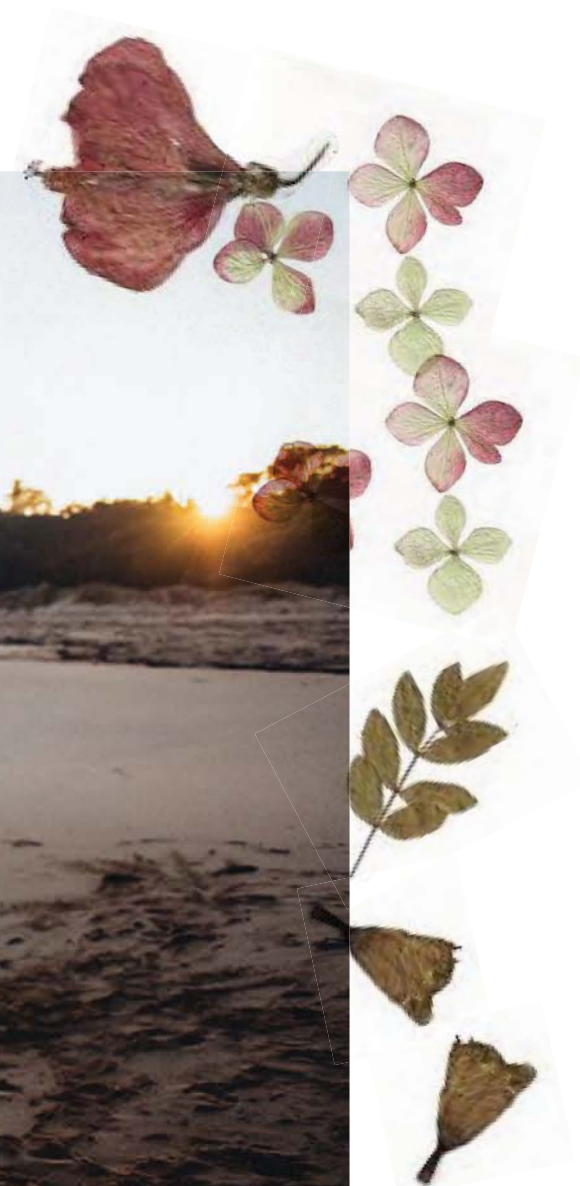
Lily Cummings x Sophie Sheppard